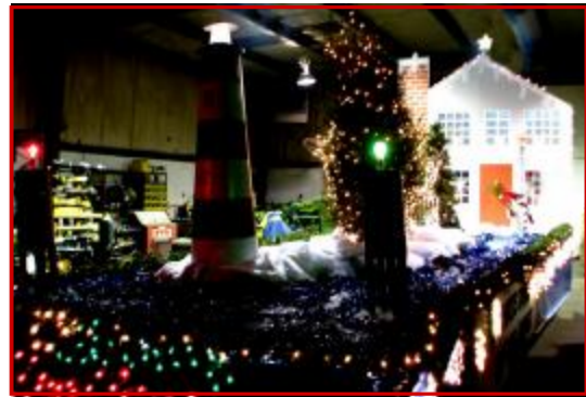
The final lights test