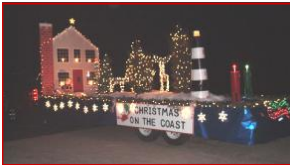
Ready to roll