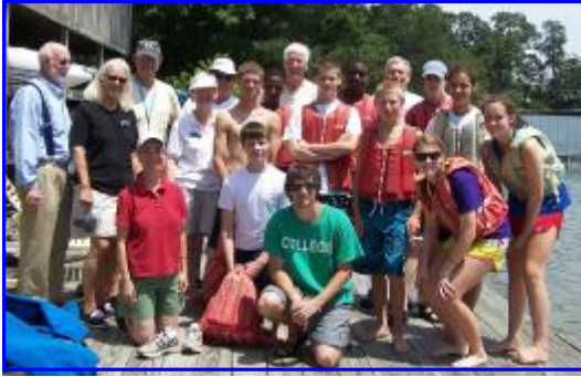
Nailers and Sailors

The Kiwanis and St Andrews Presbyterian church sponsor an annual week long work-camp for high school aged young adults. The focus is on community service and the campers work in the mornings repairing, painting and improving houses for deserving low income people in our community. The afternoons are devoted to sailing and paddling. The campers also are entertained in the evenings by various families. They reside in tents on the church grounds. Sound like fun?