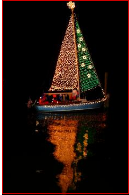
Holiday lights on Carter's Creek