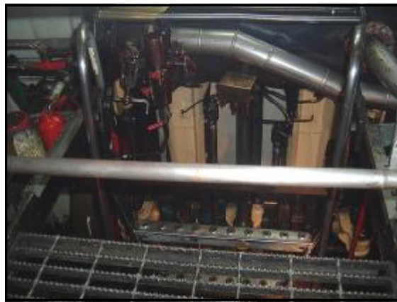
Mike's engine room?

Each connector on the manifold has a small seacock to allow you to open or close it. In the female end of the manifold I connect a male quick disconnect hose fitting. That's it.